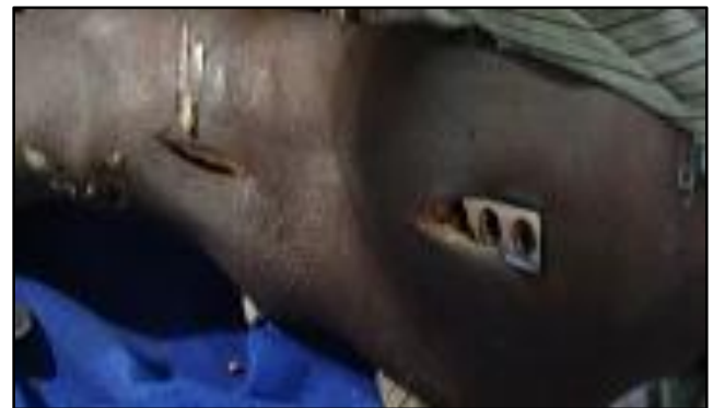
Figure 1: Cadaveric Study - Proximal and Distal Windows

of the Brachialis and deltoid were incised to allow the passage of the tunnelling instrument through to the proximal incision. A longitudinal incision from the posterior part of the Acromion process to the lateral epicondyle was made to identify the axillary nerve, radial nerve and plate. Joining the MIPPO incisions and dissecting deeply to the plate in order to identify the radial nerve. The relationship between the radial nerve and the plate with the forearm in supination was 2.8 - 4.6 mm (3.6 mm). The relationship between the radial nerve and the plate with the forearm in pronation - Radial nerve moves close to the plate by 0-3 mm. To reduce the risk of radial nerve injury, the forearm must be kept in full supination during plate insertion and excessive force should be avoided during retraction of the lateral half of the Brachialis muscle together with the radial nerve in the distal incision.