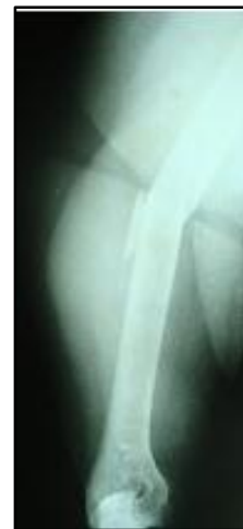
Figure 14: Lateral View