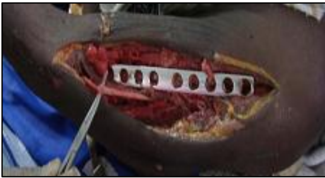
Figure 4: Cadaveric Study - Radial Nerve Position in Supination with Plate Positioned