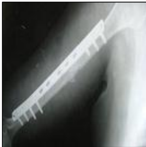
Figure 16: Lateral View