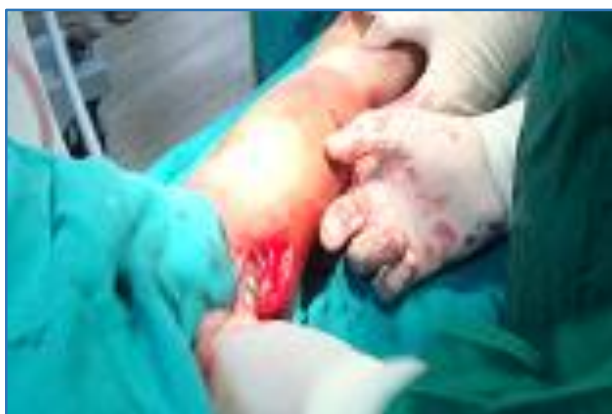
Figure 9: Extraperiosteal Tunnel Creation