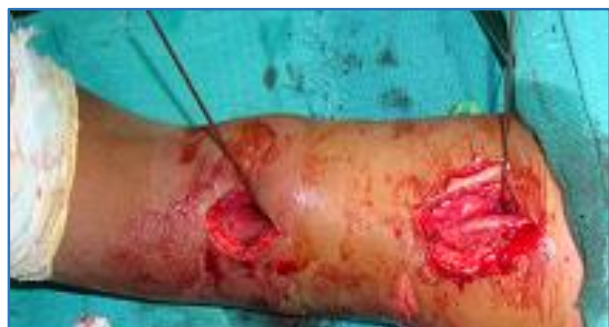
Figure 10: Plate Provisionally Fixed with K Wires