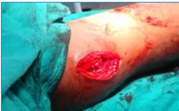
Figure 7: Proximal Window