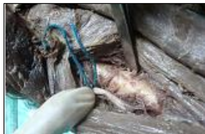
Figure 3: Cadaveric Study - Radial Nerve Moves Close to Plate while Pronation of Forearm