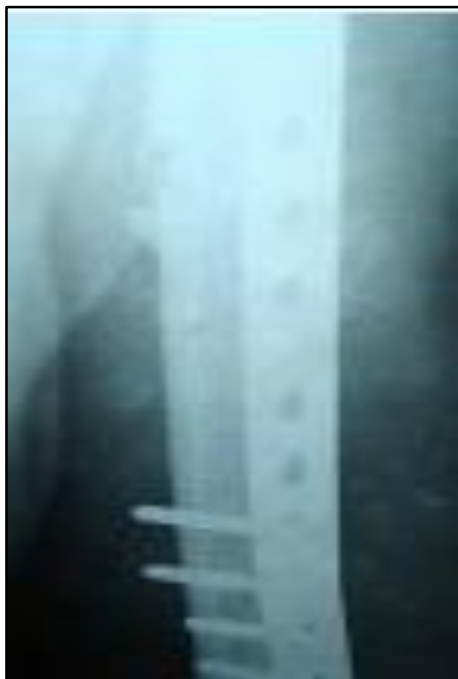
Figure 17: 6 Weeks Post-Op