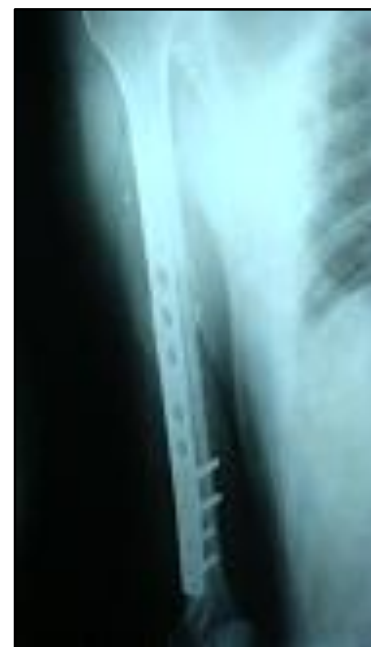
Figure 19: Lateral