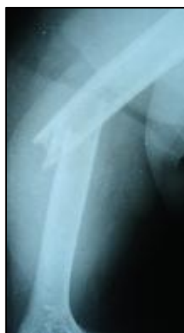
Figure 13: Pre-Op X-Ray - AP