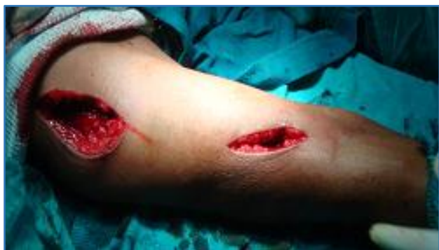
Figure 8: Both Proximal and Distal Windows