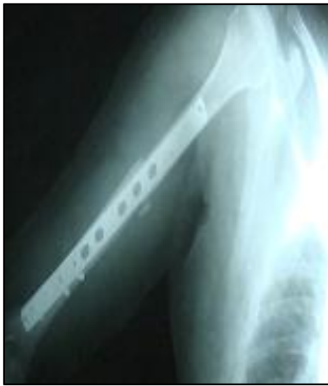
Figure 15: Immed Post-Op X-Ray - AP