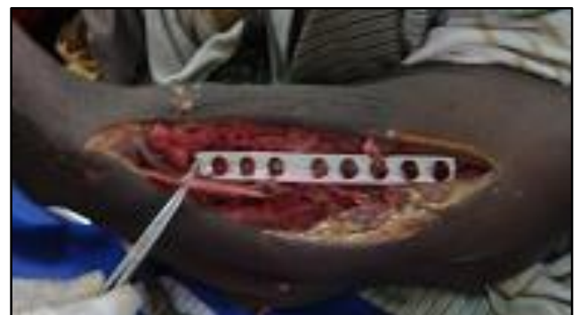
Figure 2: Cadaveric Study - Radial Nerve Position in Pronation with Plate Positioned