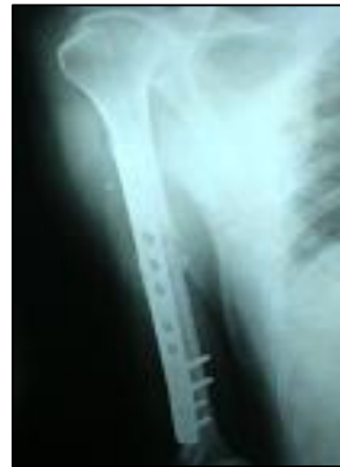
Figure 18: 12 Weeks Post-Op - AP