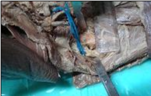
Figure 5: Cadaveric Study - Radial Nerve Moves Away from Plate while Supinating Forearm