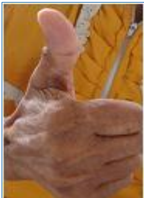
Figure 21: Radial Nerve Function Recovered

Another patient's radial nerve function recovered after 12 weeks without any secondary procedure.