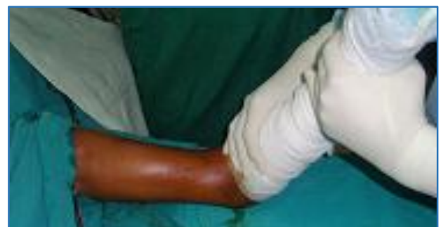
Figure 6: Position of Arm

Any significant mal-alignment is compensated by shoulder range of motion, as in the closed treatment of these fractures. The anatomical alignment is believed to be restored when the skin crease of the arm is normal in appearance and the longitudinal axes of the main fragments and the plate are parallel to each other when visualised with the C-arm. When the anatomical alignment has been achieved, the previously placed screws are then tightened definitively and further fixation of the plate is accomplished by inserting screws either percutaneously or under direct vision with at least 3 screws proximal and distal to the fracture site. The insertion of the screws can be done either through the skin incisions or additional stab incisions. The radial nerve is not exposed during this procedure.